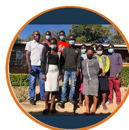
First e-learning class, Nkhoma College of Nursing, Malawi.

Participating schools receive hands-on training to instantiate their curriculum in the platform, fees for the platform itself, and 24/7 remote technical support. Technical partner AdaptIT / Wisenet has also made devices available to several participating schools for their students on a limited basis. Eight partner schools are teaching courses using the platform as of early 2022.