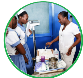
Nursing Leader Training Students at FSIL, Haiti.

The Center helps provide the support and resources needed to empower nurses in lesser-resourced countries to advocate for better clinical outcomes and serve as leaders in improving the quality of and access to health care. One of the critical ways to pursue these goals is Nursing Leadership Training . The Center works in partnership to increase access to nursing leadership and professional development opportunities for the nurses within partner facilities. The Center may provide funding for the leadership training.