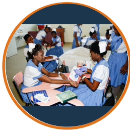
Students Practice Techniques at FSIL Nursing School, Haiti

Through parent organization, the Medical Benevolence Foundation (MBF), the CGND has a long history of working with USAID / ASHA grants for building construction and expansion. Donor partners to MBF / CGND have helped provide needed infrastructure and equipment upgrades to dozens of schools. In pursuit of strengthening the quality of education offered, the CGND is always interested in assisting schools in determining a long-term plan for their facilities. The Center may also offer resource solutions to fulfill those plans.