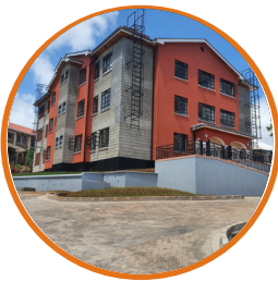
New Dormitory, Clive Irvine School of Nursing, Kenya

If students and staff need access to specialty courses, the CGND can help. Drawing from a broad range of course materials made available by our education partners, the Center will work with you to determine the right tools for your needs. Some course materials may be micro-credentialed or qualify for academic credits, in your local country or with the providing institution.